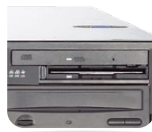
1 x 3.5" bay for FDD, slim ODD + slim FDD or storage kits