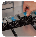
4 x middle 80mm hot-swap fans