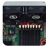
Enhanced 2 x rear 80mm fans