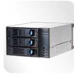
2 x 5.25" bays for ODD or storage kits