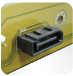
Optional 6Gb/s SATA backplane