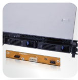
Optional 2-port 6Gb/s SATA backplane with dummy trays