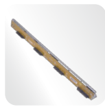
4-port 6Gb/s SATA backplane