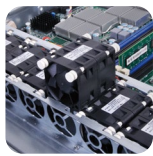
Rubber damping middle PWM fans