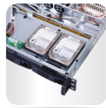
Built-in 2 x 2.5" bays