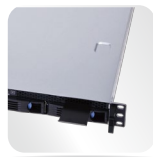
Built-in info Tag