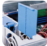
Air baffle to prevent air circulation