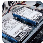
Tool-less 2.5" HDD mounting kit