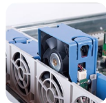
Hot-swap fan module