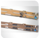
Optional 8-port 6Gb/s mini-SAS or SATA backplane