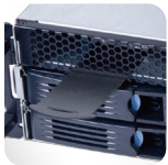
Built-in info tag