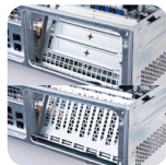
Easy-swap 3-slot or 7-slot rear window (Option)