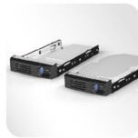
HDD carrier for 2.5" SSD or 3.5" hard disk