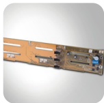
Built-in 12-port 6Gb/s mini-SAS backplane