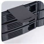
Built-in info tag