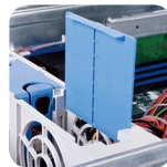
Air baffle to prevent air circulation