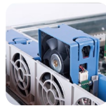
Hot-swap fan module