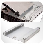
Tool-less lock for slim FDD or 2.5" HDD kit