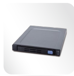
Slim FDD or 2.5" HDD with SK51101