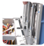
Fan bar with anti-vibration rubbers