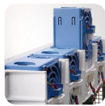
4 x middle 80mm hot-swap fans