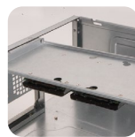
Optional bracket for 1 x internal 3.5" HDD or 2 x internal 2.5" bays