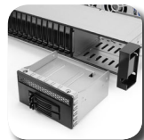
Optional drive cage for 2 x 2.5" hot-swap HDD + 1 x slim ODD