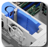
Air baffle to prevent air circulation