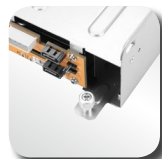
Tool-less ODD drive cage