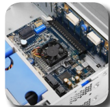
12Gb/s backplane with SAS expander controller