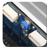
Tool-less backplane installation