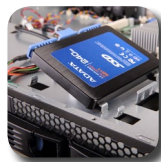
Up to 3 x internal 2.5" HDD bays