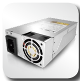
Supports Flex ATX PSU