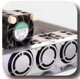
Up to 3 x 40mm PWM rear fans with anti-vibration mechanism