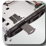
Built in info tag