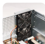
Optional 2 x rear 80mm fans