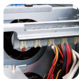
Enforcing card holder