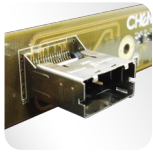
Optional 6Gb/s mini-SAS backplane