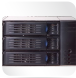
4 x 5.25" bays for ODD or storage kits