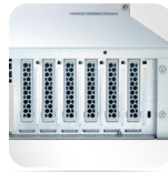
Changeable low profile rear window