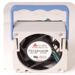
Optional tool-less 4 x middle hot-swap fans