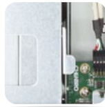
Tool-less lock for 5.25" bays