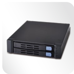
2 x 3.5" bays for FDD or SK51201